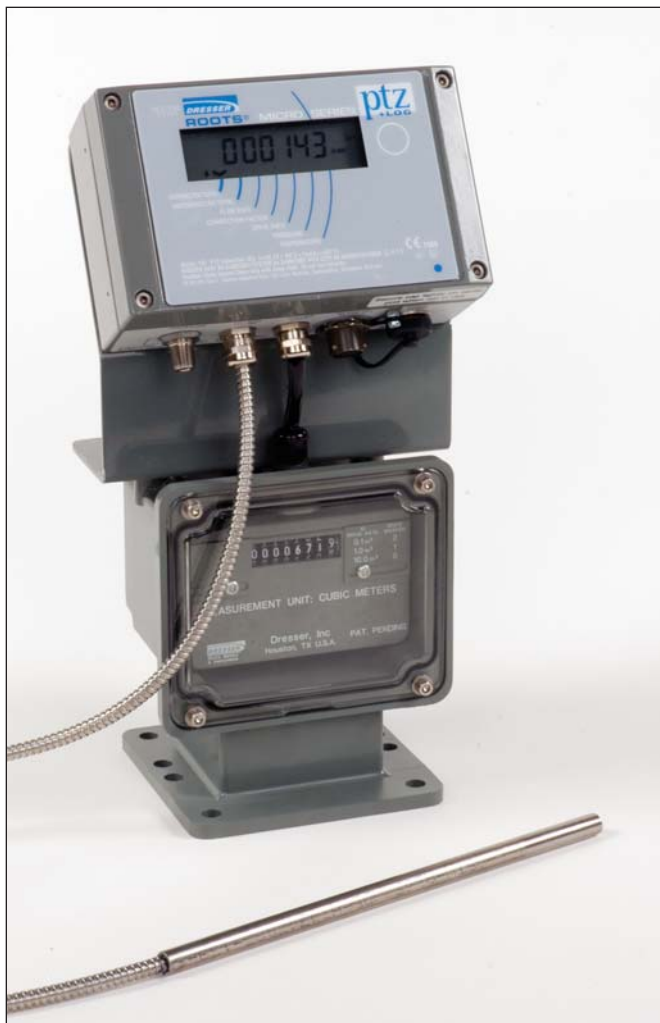
ROOTS® Micro Corrector, Model PTZ + Log, ID Mount Version

This second generation Micro Corrector has the enhancements customers have been asking for. Using the proven MC platform, features were added that make it the easiest corrector to use. Functions were added that enhance data logging and lower operation and maintenance costs, while retaining the great features introduced in the original product.